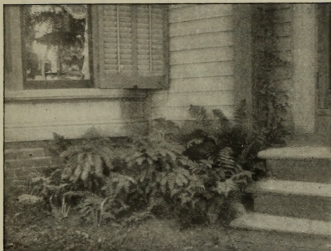
CLUMP OF FERNS IN SHADY CORNER.